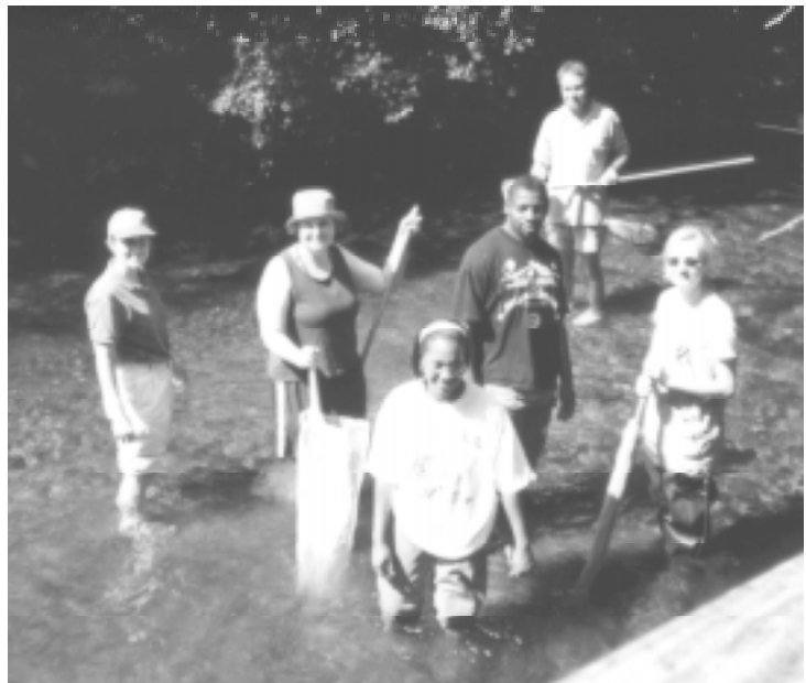
Adopt-A-Stream trainers collect macroinvertebrates in North Georgia stream.

An outdoor classroom is an area on the school campus that has been enhanced by the creation of plant and wildlife habitats to provide a place where students, their teachers, and their families can engage in hands-on learning experiences about the natural environment. Features of an outdoor classroom can include, but are not limited to, schoolyard wildlife habitats, nature trails, gardens, wetland study areas, composting and recycling projects and arboretums. Outdoor Classroom Grants will be awarded to support planned projects or to enhance existing projects. Only one $750 grant per school will be awarded! All schools (public or private, all grade levels) are encouraged to apply. For a full application, go to www.ealliance.org .