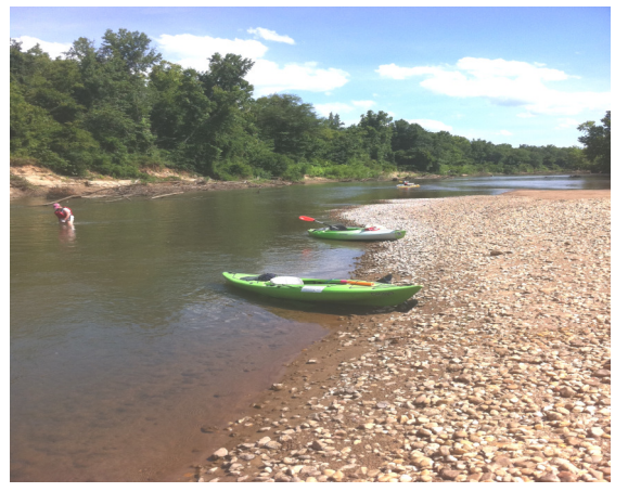
Sampling the Oconee River, which was experiencing low flows as were many other rivers this year in Georgia.

Paddling 106 miles allowed us to see, up close, that there are many users of the waters of the Oconee River. From paddlers to local industries, to municipalities and homeowners. We have witnessed that the river's health is directly related to the management of the river and its watershed, and that all users must do their part to protect our waterways. We would like to highlight that the Environmental Protection Division is working hard to protect these waters, through permitting new treatment facilities and the enforcement and remediation of the stream buffer violation. Together, we are the eyes and the ears of our rivers.