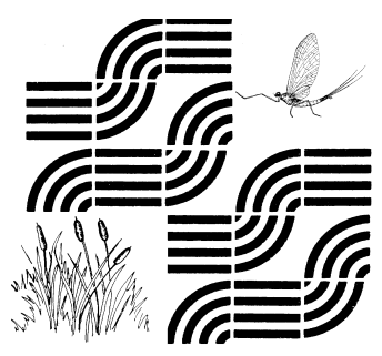
Department of Natural Resources Environmental Protection Division

Volume 18, Number 5, September/October 2011 Editors: Allison Hughes, Tara Muenz