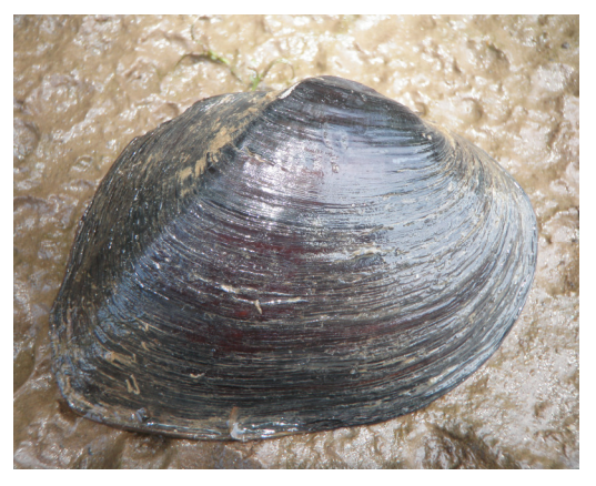
A freshwater mussel, the Georgia Elephant Ear, Elliptio dariensis , was found on the Oconee River.

For more information visit www.garivers.org http://www.garivers.org/paddle_georgia/pghome.html