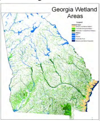
National Wetland Inventory Map

Please join us in an effort to better understand and protect these very important ecosystems! We have many workshops scheduled, some of which will be a joint Adopt- A-Wetland and WOW! Workshops . A list of workshops can be found at www.GeorgiaAdoptAstream.org under 'Announcements.'