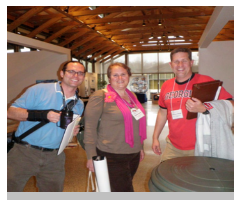
Meet AAS Trainers