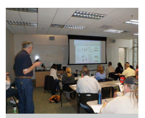
Learn from the Experts