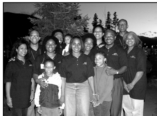
Members of WAWA have worked with AAS to promote water education in southwest Atlanta

West Atlanta Watershed Association (WAWA) has made huge strides in community partnerships and outreach on the watershed level, earning the Extraordinary Volunteer Watershed Effort Award . WAWA has more than ten years of momentum behind its initiatives to protect Proctor, Utoy and Sandy Creeks in Southwest Atlanta. WAWA is working with the City of Atlanta's Department of Watershed Management, Adopt-A-Stream and Project WET to coordinate teacher education in West Atlanta schools. Students from Mays High School have received Adopt-A-Stream training, and have adopted a segment of Utoy Creek flowing through their school grounds. WAWA also facilitated an Adopt-A-Stream training for faculty and staff at Spelman College who plan to incorporate monitoring into their curriculum. They are also developing a module for community action workshops that will involve Proctor Creek residents in Adopt-A-Stream and Project WET training, ensuring that involvement will continue in the future.