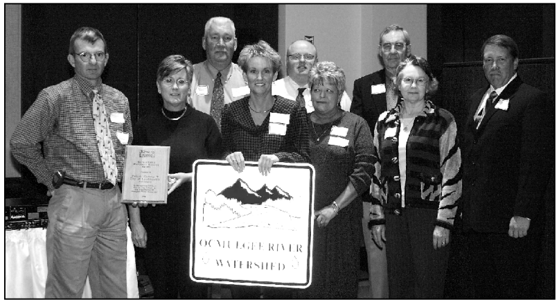
Organizers of the Pulaski County and City of Hawkinsville cleanup accept their plaque and watershed sign.