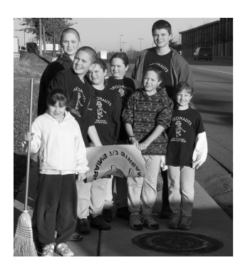
Cherokee Co. home school students paint storm drains

Countless school aged youth in Georgia can be found splashing in the stream as they collect macroinvertebrate samples and test chemical parameters. Teachers who use the Adopt-A-Stream program to enhance their classroom studies provide an avenue for students to have fun while learning science. To encourage teachers to use Adopt-A-Stream in their classrooms, we have designed a K-12 Educator's Guide to support teachers as they incorporate water quality education activities into their curriculum. These K-12 activities include both inside and outside activities and some activities do not even require a stream. Adopt-A-Stream plans to have this guide correlated to the Georgia Performance Standards by the start of the 2007-2008 school year.