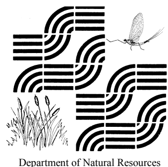
Department of Natural Resources Environmental Protection Division

Volume 24, Number 4 October – December 2017 Adopt-A-Stream Staff, Editors