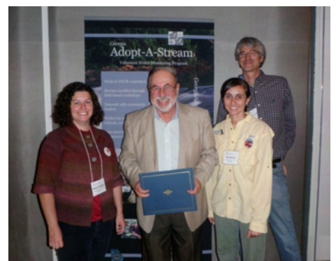
AAS Awards Ceremony