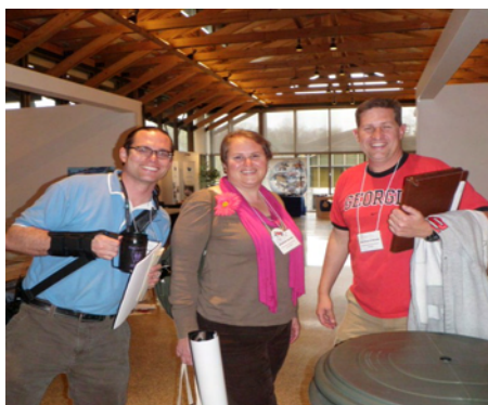
Meet AAS Trainers