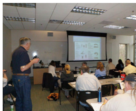
Learn from the Experts