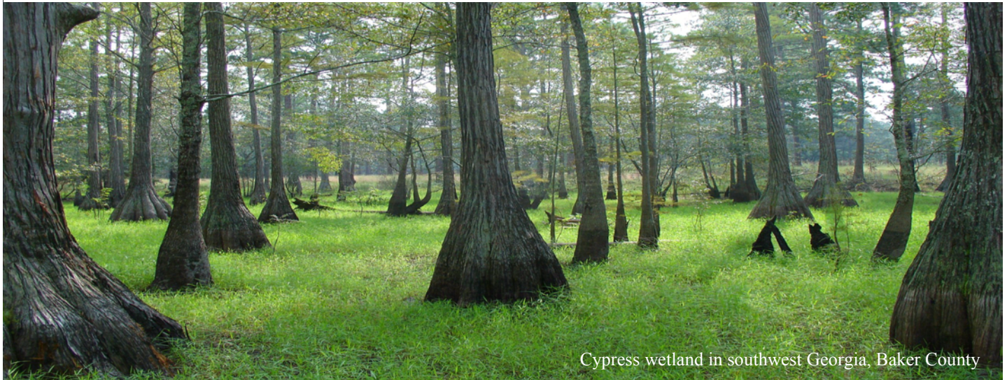
Cypress wetland in southwest Georgia, Baker County