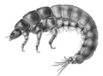
Net Spinning Caddisfly