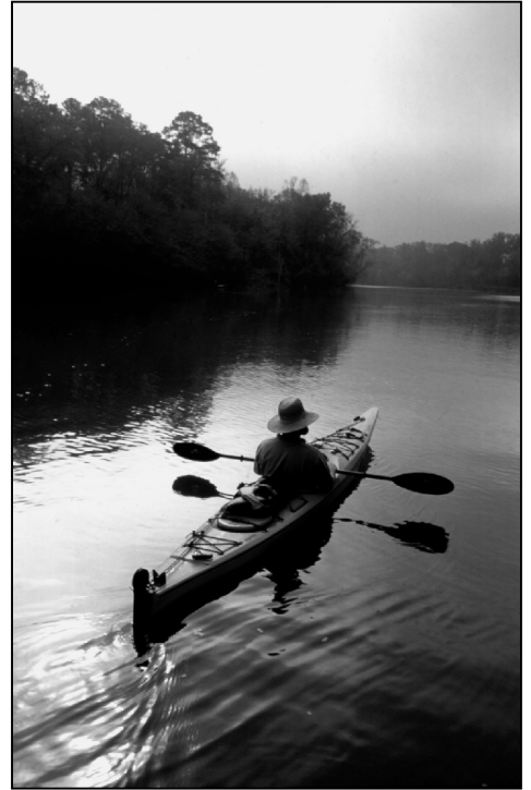
A kayaker drifts down the Chattahoochee in Heard County.

The dates are June 25 - July 1. For details or to register please visit www.garivers.org/paddlegeorgia/pghome.html