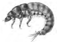
Net Spinning Caddisfly