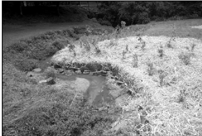
A successful streambank stabilization project protecting an urban stream in DeKalb.

Another significant undertaking included revisions to our benthic monitoring protocol.