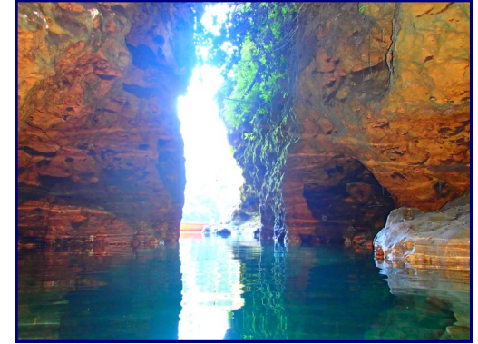
The Shaft, a popular spring

Located on the west bank of the river flowing out of a crevice in the limestone bluff, the spring has been explored by cave diver Paul DeLoach who described a 2011 dive in the spring: "As you proceed into the cave some 250 ft there is a karst window overhead from which you can see surface light. There is a small depression at the surface and a small surface pool. After passing under this feature the cave floor begins to drop from 40 feet to 70 feet, and then again to almost 90 feet. The cave then takes an easterly turn and goes beneath the Flint River, continues into Mitchell County and changes from a stream channel to