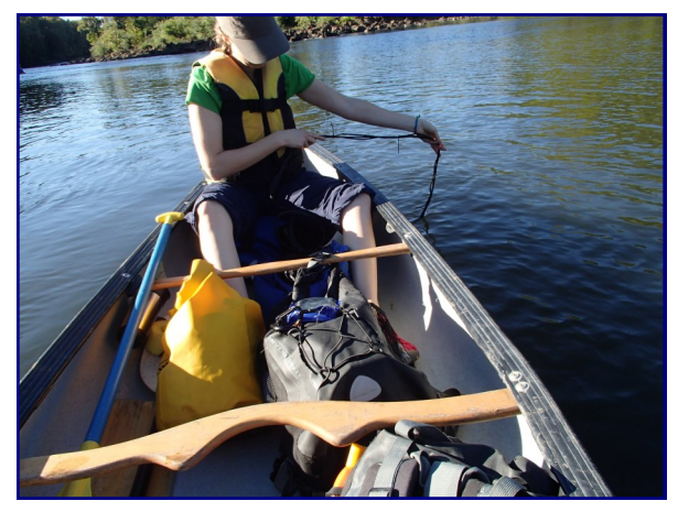
Probes deployed from canoe

In the fall of 2014, the Georgia Adopt-A-Stream program purchased several Orion Star A329 meters to test and loan to targeted monitoring groups. These meters have multiple