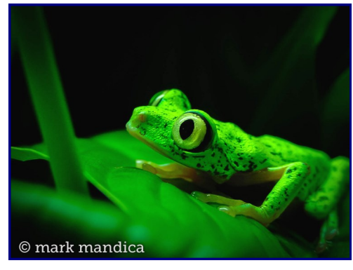
The critically endangered Lemur Leaf Frog, Agalychnis lemur

Our Mission: The Amphibian Foundation is dedicated to connecting individuals, communities and organizations in order to create and implement lasting solutions to the global amphibian extinction crisis. Through conserving amphibians and their ecosystems, we are protecting one of the most sensitive and diverse groups of animals for the benefit of wildlife biodiversity, humanity and the environment.