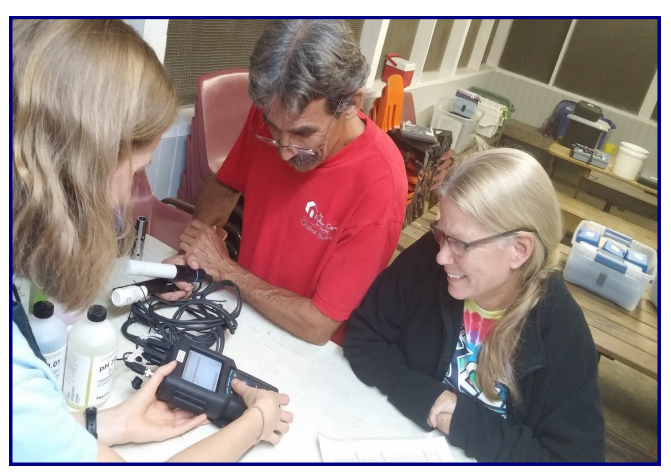
Fall Float monitoring team conducting meter calibration

probes that quickly measure pH, conductivity, salinity, dissolved oxygen, and temperature, allowing volunteers to collect more samples in less time and with less equipment. For the last two years, Adopt-A-Stream staff and volunteers have conducted side-by-side comparisons of the Orion meters and the traditional Adopt-A-Stream testing kits during targeted monitoring events such as the Fall Float on the Flint, building a data set that provides reliable information about the accuracy of the meters. For the Fall Float, we decided to forgo using the traditional AAS kits in order to save time. Overall, the AAS monitoring team took 20 samples on the Flint River, which was slightly fewer than in previous years because the trip only lasted three days instead of four. Additionally, four of the planned monitoring sites were dry, likely due to the fall's severe drought.