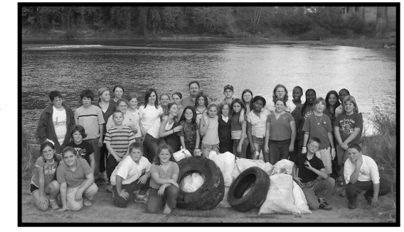
Wheeler County 4-H cleanup on the Oconee River

Thanks to the well over 75,000 hours contributed by our volunteers, we were able to improve the quality and health of our wildlife and recreation areas. Aside from the obvious aesthetic benefits of garbage removal, these clean-ups help protect the habitat for Georgia's thousands of aquatic species. So, thank you all for your hard work and dedication! Your individual contributions have combined to make a very significant difference.